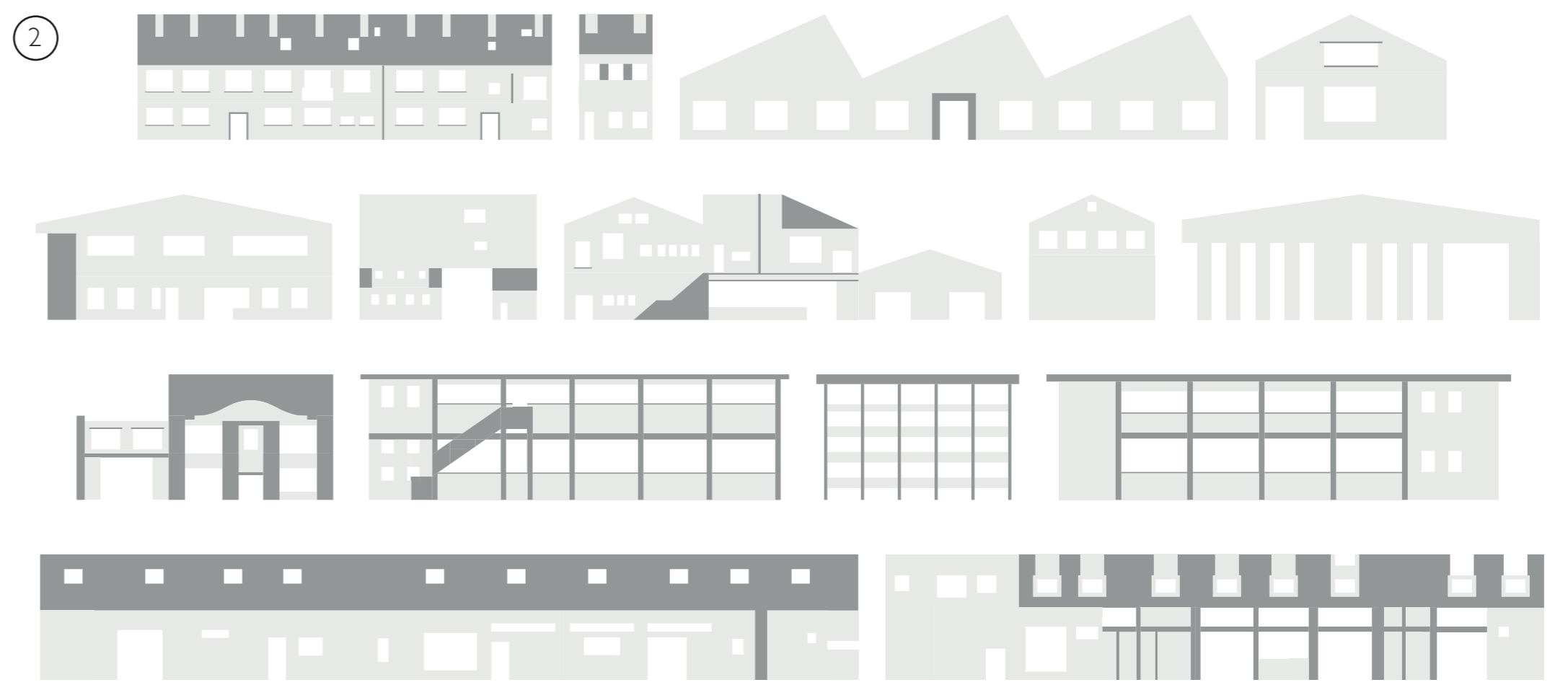
Tottenham Pavilion - Behind the Façades (in different views)