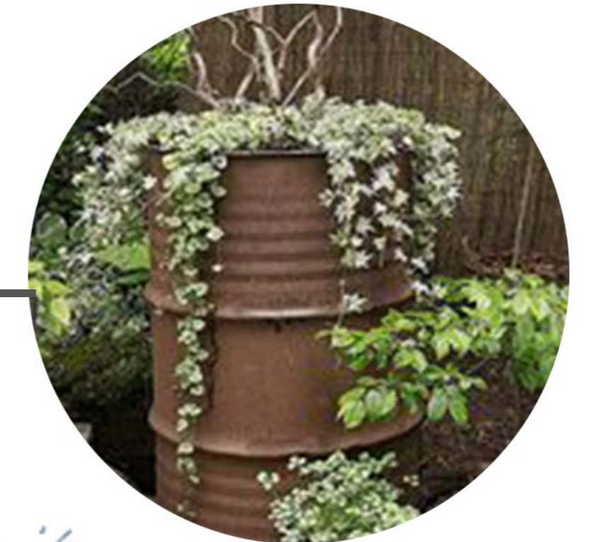
UPCYCLED PLANTERS local scrap metal turned into planters