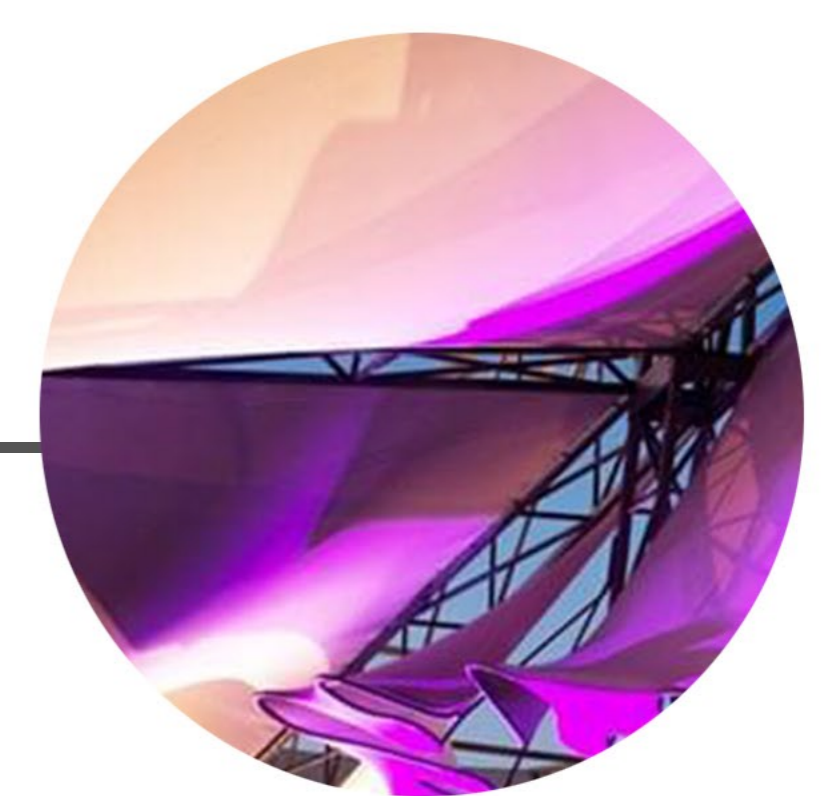
PVC COATED POLYESTER flexible division/screen for projections

The design is inspired by Harringay's self build aesthetic with a focus on upcycling of materials to generate a creative, colourful vernacular architecture. The area's warehouse typology is also reinterpreted by expressing the pavilion's structural skeleton as a sculptural element. This structure creates an open air shell that the local artist community is free to organize according to their needs. The intention is to empower the local community to use the pavilion as a canvas to express themselves.