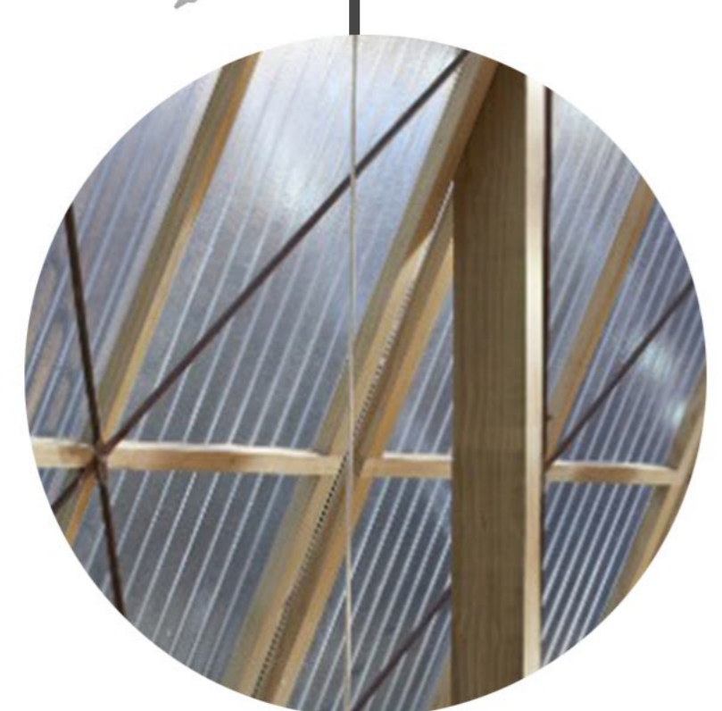
POLYCARBONATE ROOF SHEETING translucent and can be ambiantly lit at night