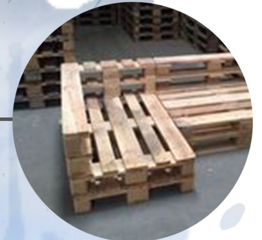
PALLET FURNITURE throwback to pallet paradise