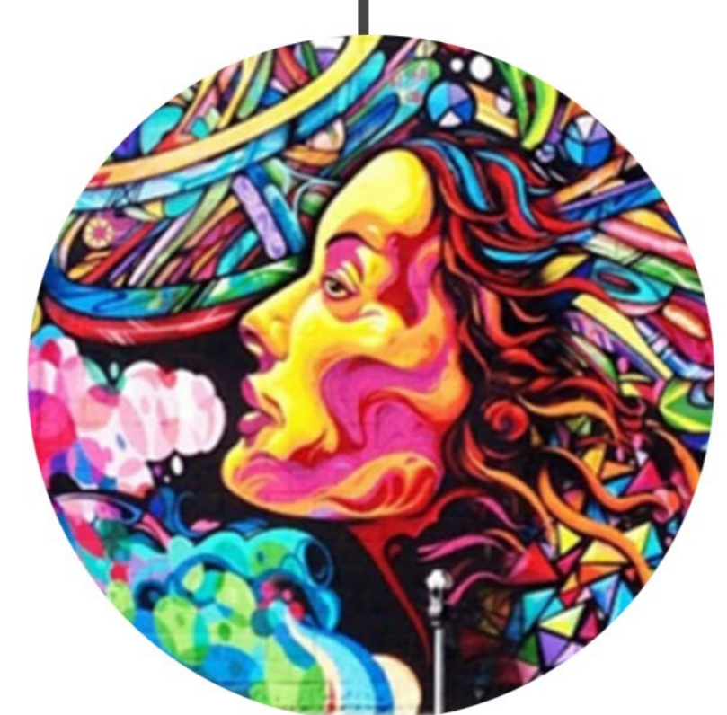
PUBLIC ART WALL local artists can leave their mark on the pavilion