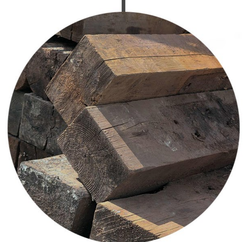
RECLAIMED TIMBER FRAME old railway sleepers or other salvaged timber