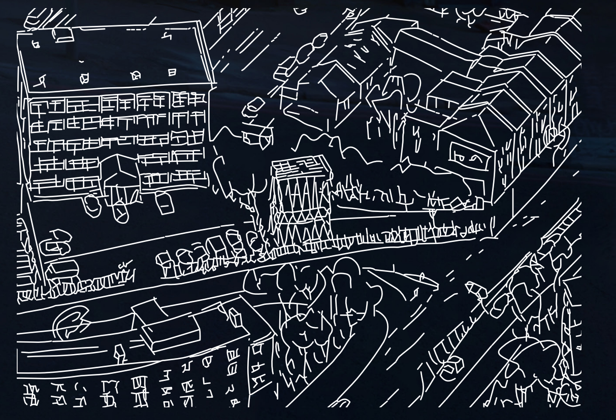
TOTTENHAM PAVILLION IN SITU - MID-RISE - DISTRICT ENTRANCE