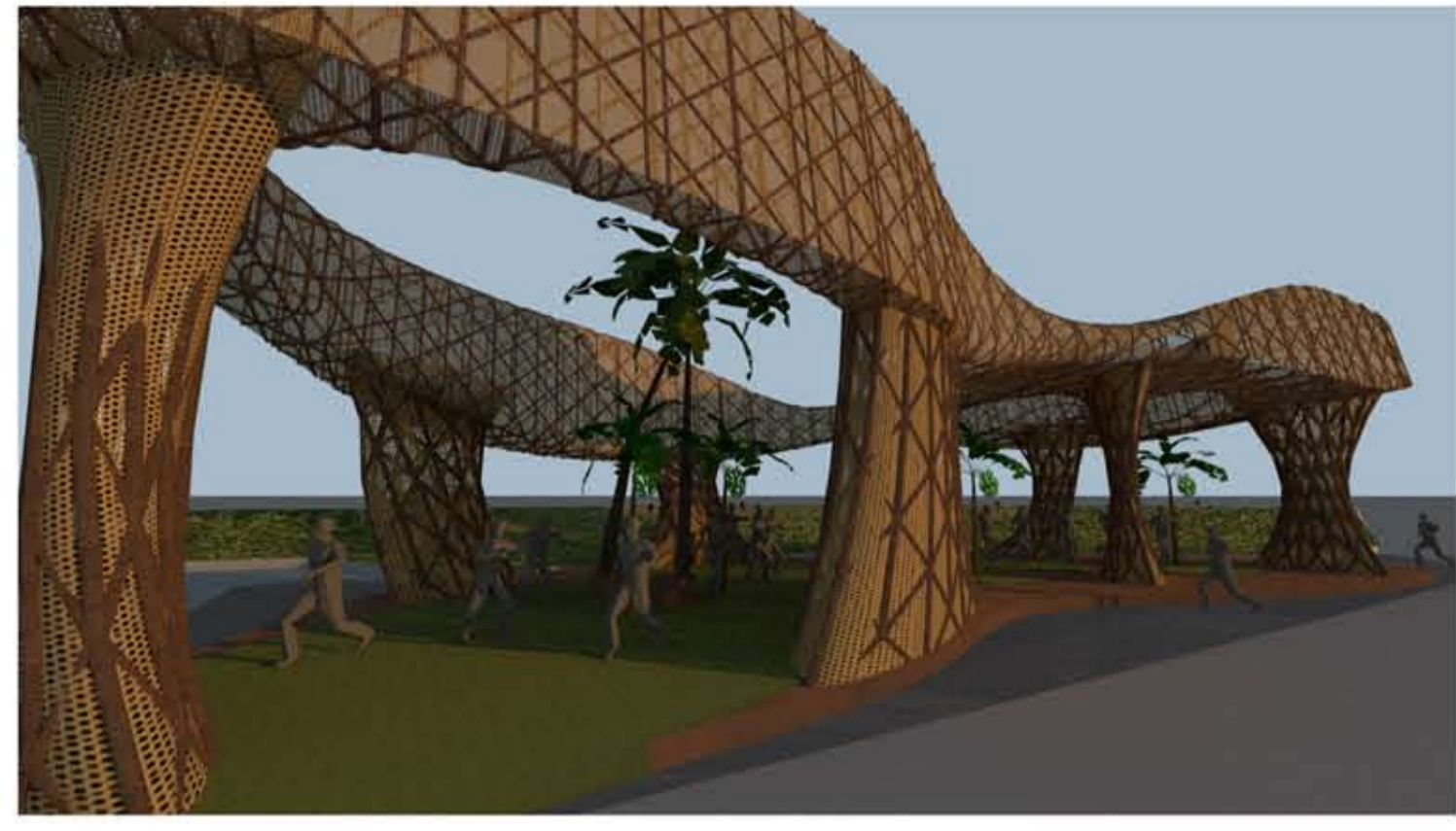
VIEW FROM REAR GATE