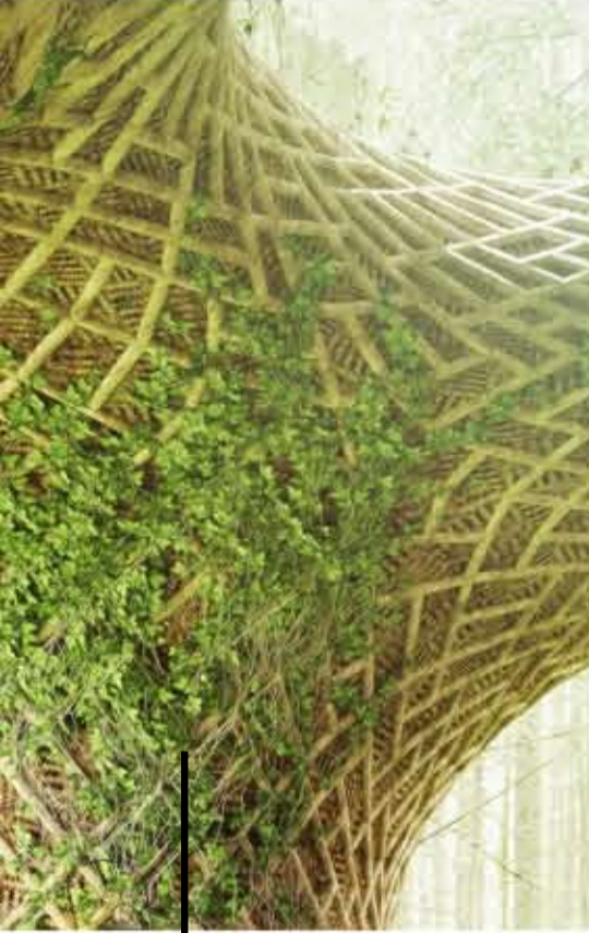
BAMBOO STRUCTURE WITH RATTAN INFILL