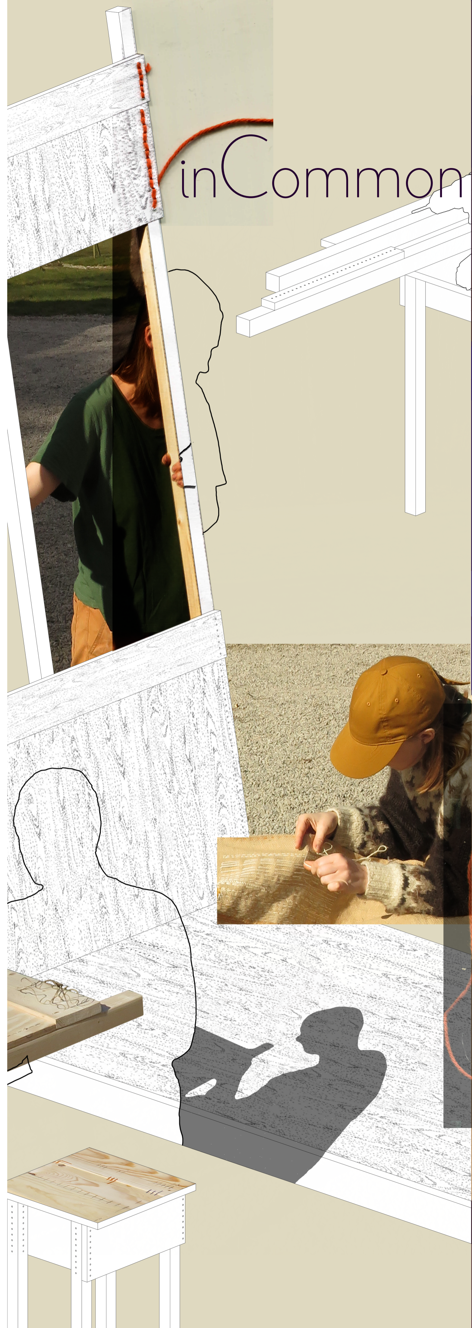
Module B with two closed sides