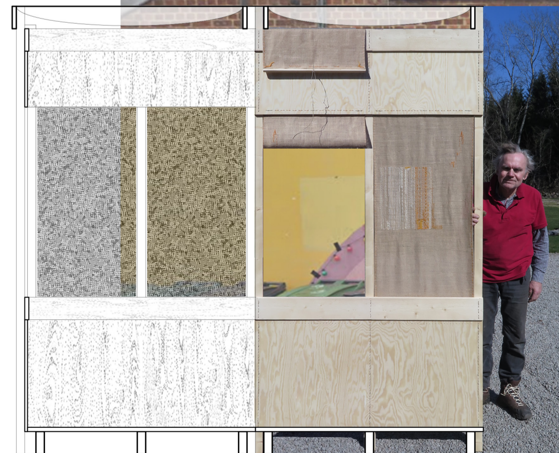
Module A with three closed sides

The interior of both modules section 1:20